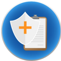
Coverage Options Fact Sheet ( English , Spanish )

The DMHC is taking action to protect consumers' health care rights and ensure a stable health care delivery system during the COVID-19 state of emergency. The DMHC's COVID-19 resource web page includes more information about the Department's actions, including the following consumer fact sheets on coverage options, testing and vaccines.