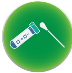
Consumer Fact Sheet on COVID-19 Testing ( English , Spanish )