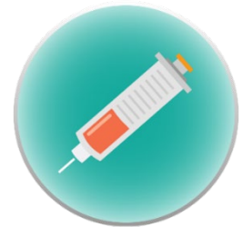
COVID-19 Vaccine Fact Sheet ( English , Spanish )

Departments throughout the state are working to respond to COVID-19 and ensure Californians have the resources they need to stay safe and healthy. As the pandemic evolves, information can change quickly. It is important that you are getting the most up-to-date information from reliable sources. You can find additional state resources below to stay informed on the latest information and guidance regarding COVID-19.