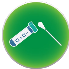
Consumer Fact Sheet on COVID-19 Testing 🇺🇸